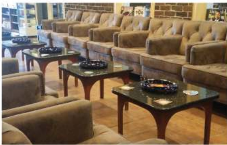
Comfortable Smoking Lounge