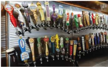
Full liquor bar with 50 draft beers