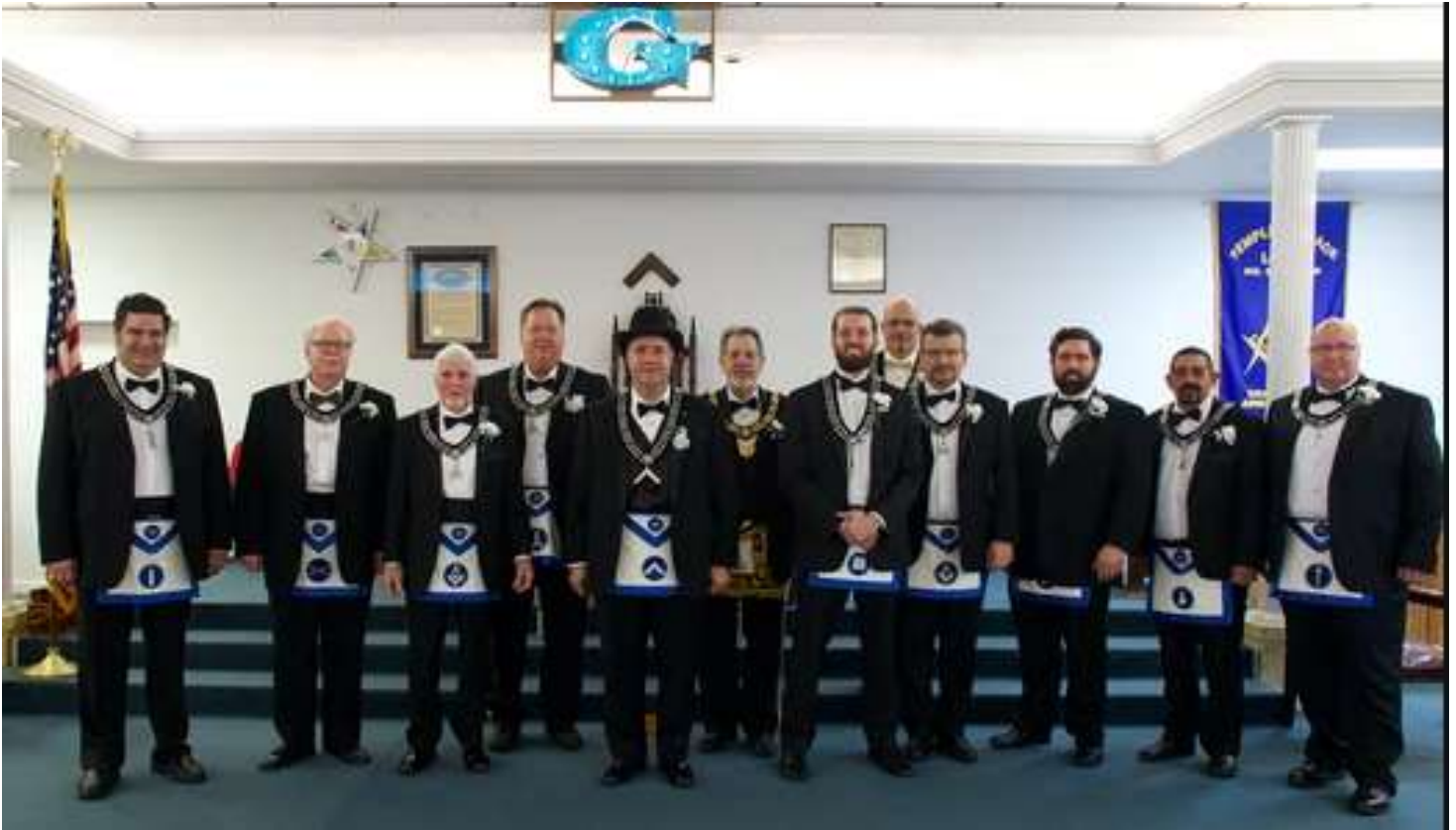
Temple Terrace Lodge No. 330 2020 Officers Installed January 4, 2020