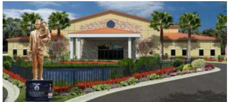
Pictured above a drawing of Egypt Shrine's new Home