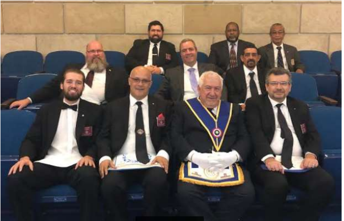
Temple Terrace Lodge No. 330 contingent at Brandon Lodge No. 114 for EA degree on May 2 nd , 2019

11807 North 56 th Street Temple Terrace, Florida