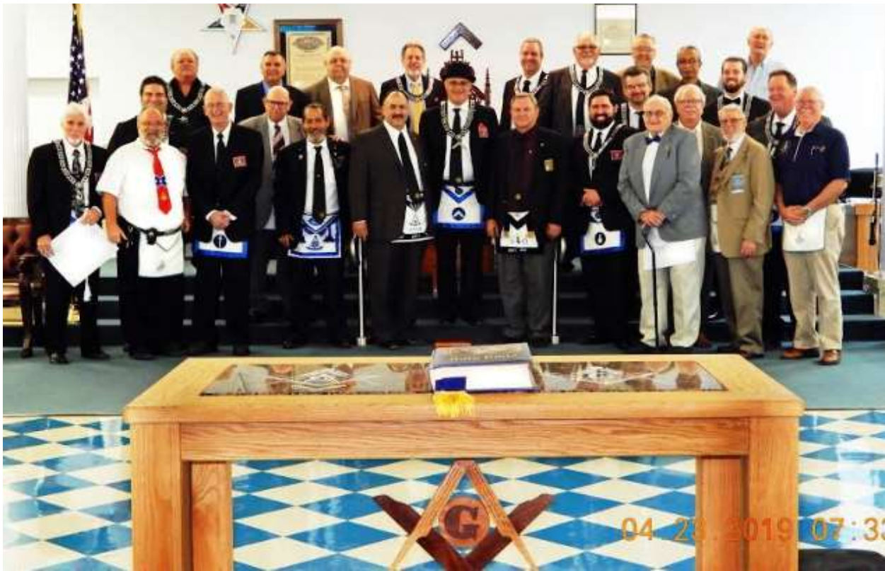
Picture of the Brothers who attended the April 23, 2019 Temple Terrace meeting.