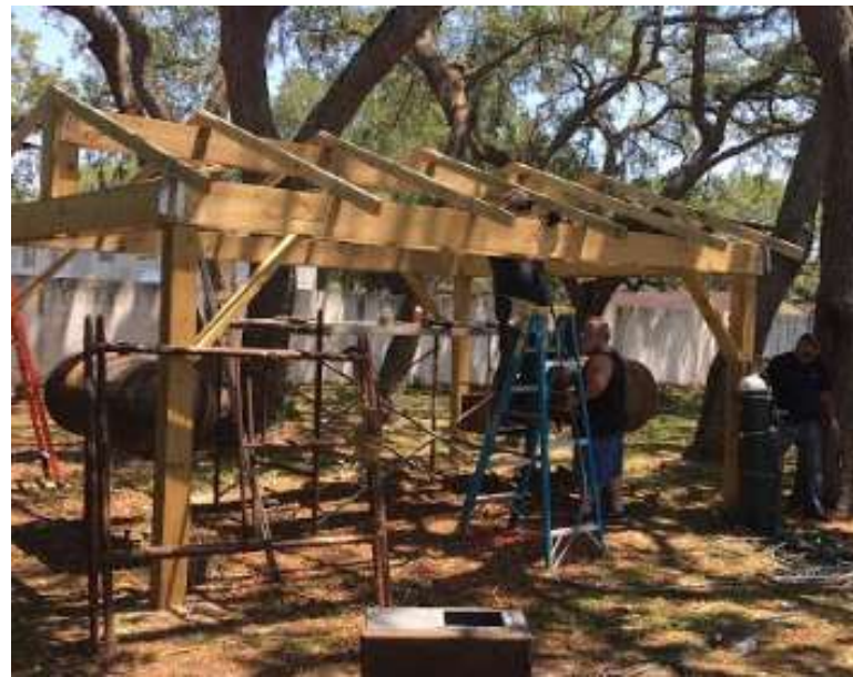
Temple Terrace Lodge construction crew hard at work on the Grillen Center, its looking better every work day Brothers