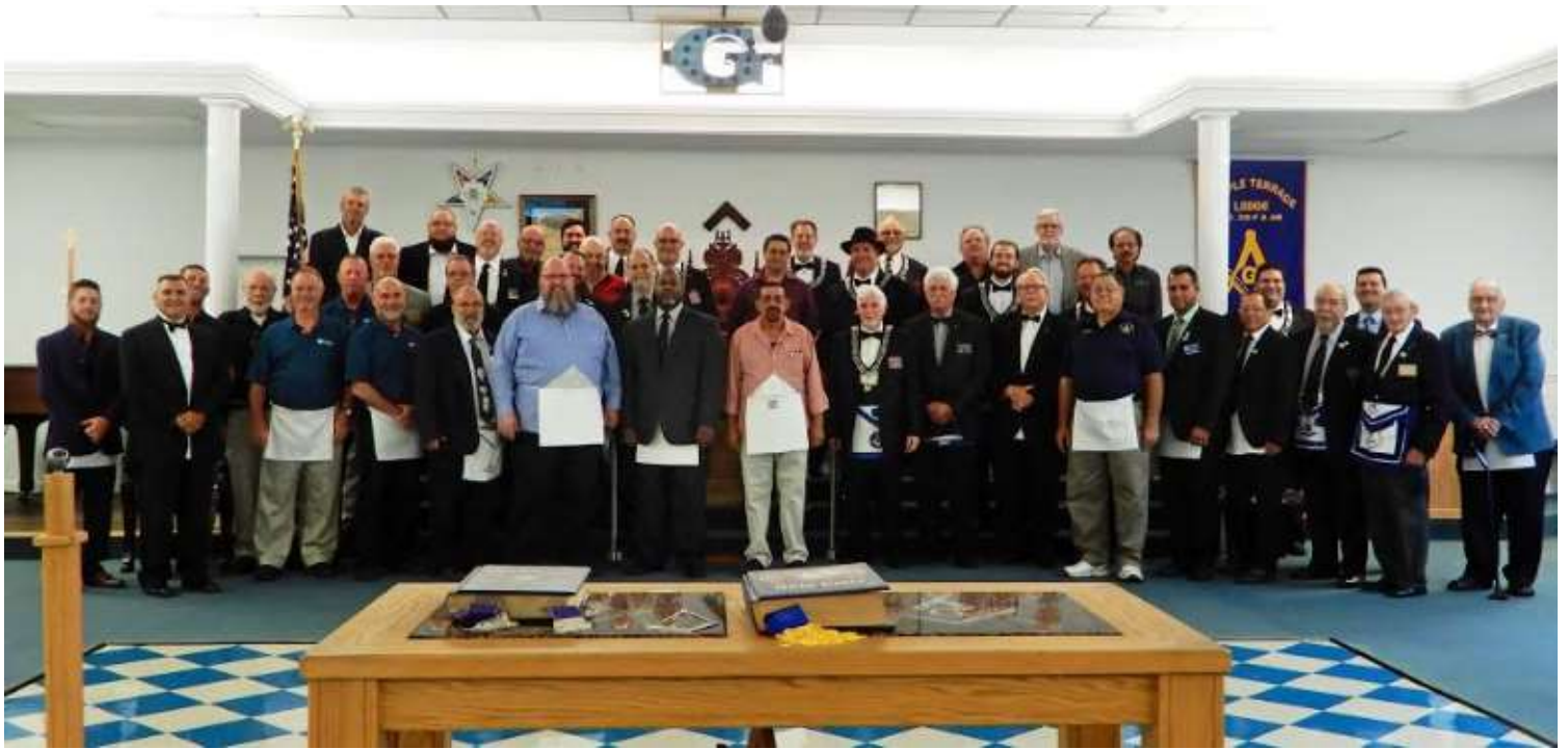
This picture was taken at the Entered Apprentice Degree held at Temple Terrace Lodge No. 330 on April 16, 2019. There were members of six different Lodges in attendance to see the three new E. As initiated.