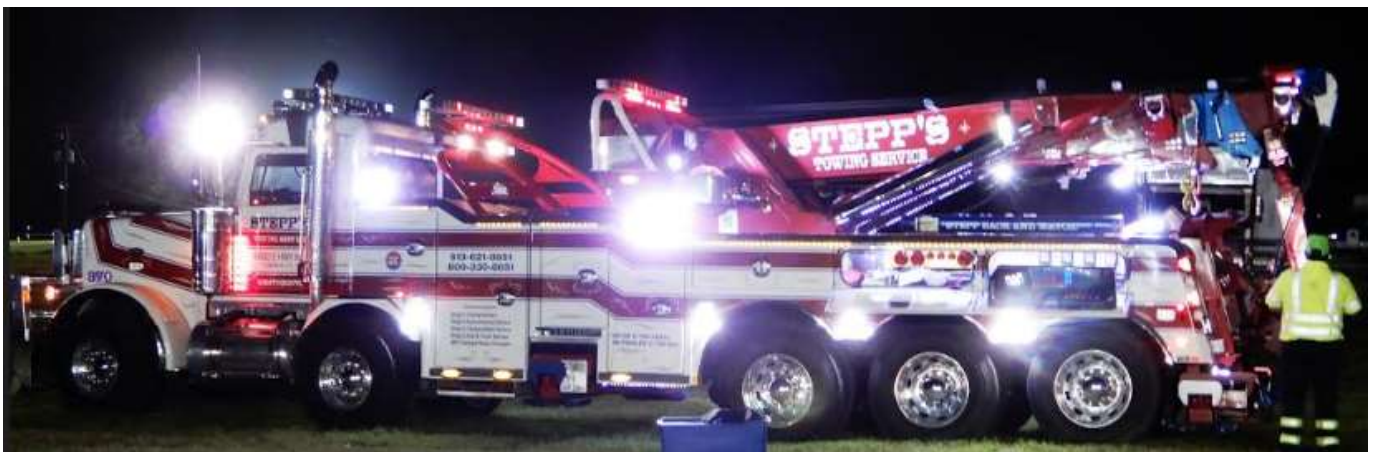
Do you need a tow? I think it will tow about anything.

Notice: Articles for the Trestle Board are due by the 20 th of the month!