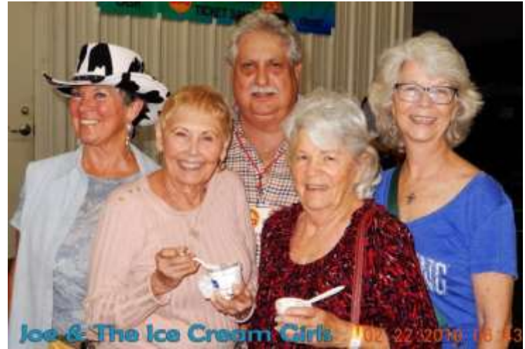
A thorn between four roses.