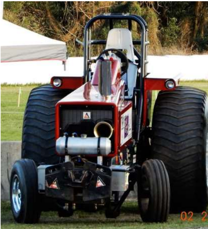
A tractor at the Farm Fest 2-22-2019.

If you know of a child that wants to go to summer camp have them check out Camp Osprey which will be held at the Masonic Park and Youth Camp next summer, this will help Camp Osprey as well as the Masonic Park.