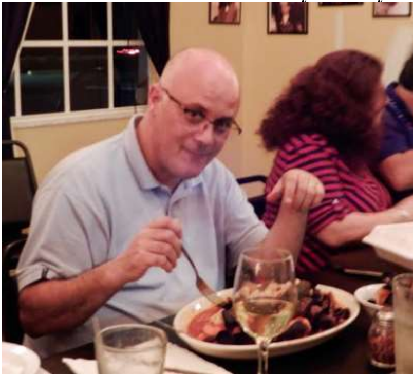
The Worshipful Master enjoying his meal.

These pictures were taken at the Past Masters Dinner on February 4, 2019 at Little Italy's Family Restaurant in Lutz.